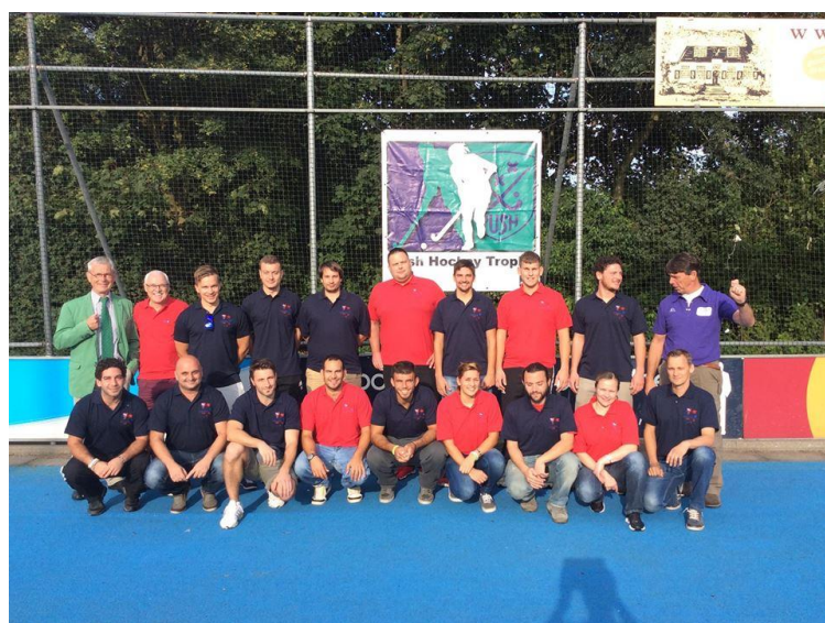
C4E Group in Breda 2015

The C4E targets talented young coaches from Europe and provides a programme of events running over a two year period. The programme is planned by the EHF Coaching group who organise workshops and webinars for the C4E group