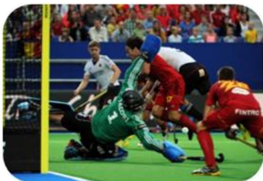
Breda Push workshop U18/U16 25-28 August 2016